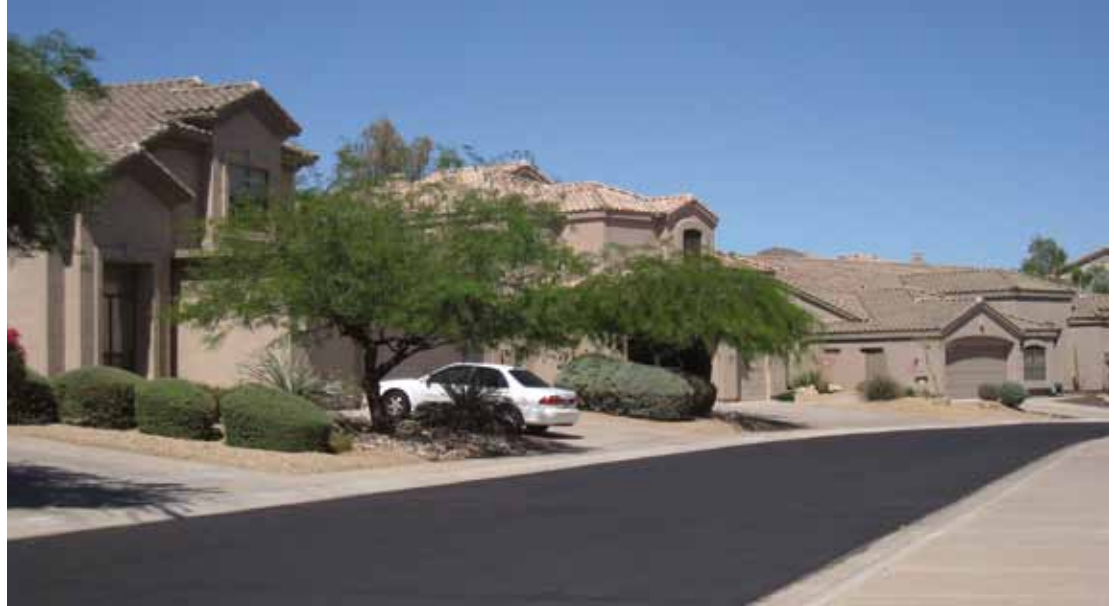
Typical street of single-family homes near the Islamic Center of the Northeast Valley, Scottsdale, Arizona.