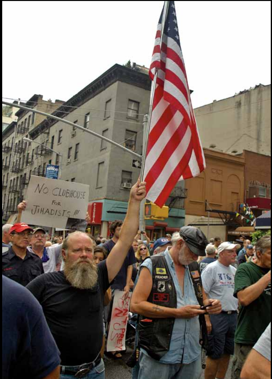
Protesters march in opposition to the proposed Park 51 mosque.