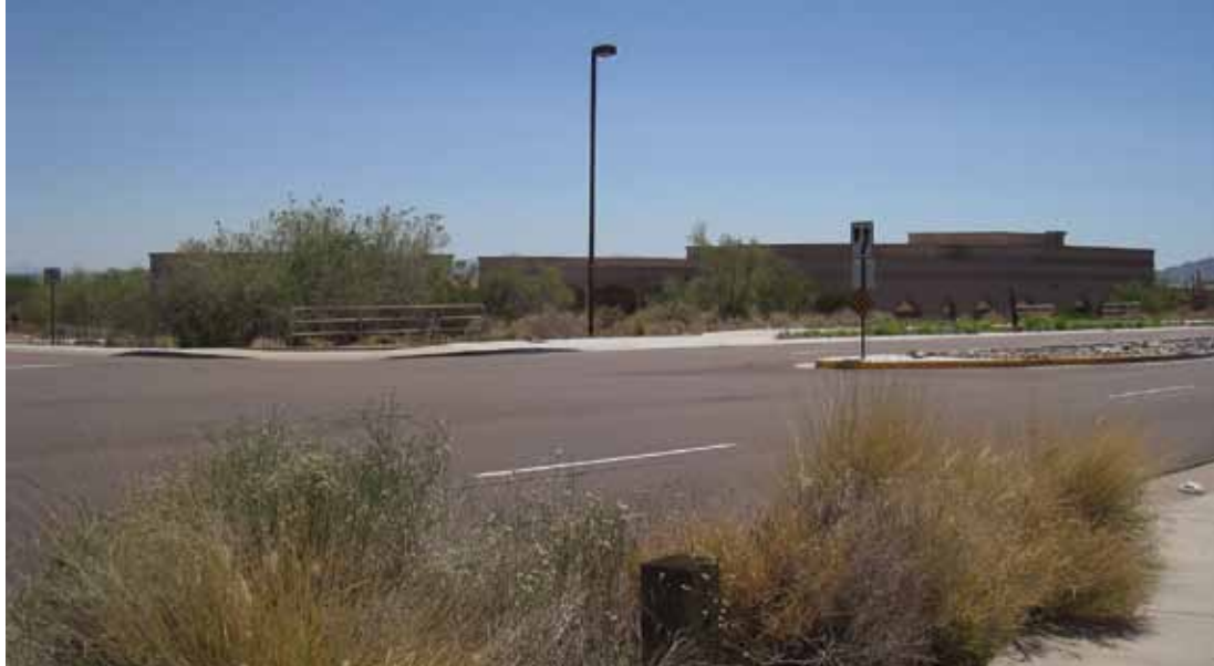
Mosque structure in Scottsdale, Arizona reflects design compromises.

As originally designed, the mosque complex had a contrasting palette and colorful stained glass windows. Opponents and some design review board members felt that the comparative brightness of the proposed structures was aesthetically incompatible with the neighborhood. More troubling for the neighbors, however, was the overall height of the complex, particularly the proposed dome and minaret. The potential loss of mountain and city views, for which most property owners had recently paid a premium, was a source of particular agitation. So troubling was it, in fact, that a number of them attempted to broker a land swap to move the mosque to a parcel of land on a nearby commercial thoroughfare.