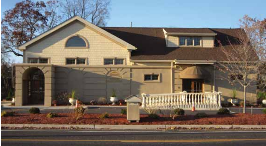
Muslim American Community Association, Voorhees, New Jersey, as built.

members were allowed to stand in the public record, and, gaining validity by neglect, they compounded with repetition and influenced deliberations. Additionally, fear-based diatribes went unchecked in comment periods and drowned out matters of purview and legitimate land use concerns.