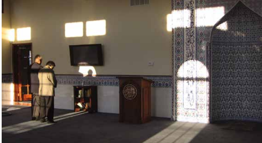
Maghrib (sunset) prayers in the Muslim American Community Association, Voorhees, New Jersey.

manage details well and think creatively on his or her feet. Ideally, they will be American-born and speak with a local accent. They should demonstrate the Muslim community's diversity and its reflection of the American melting pot—consider women (both those who wear hijab and those who do not) as well as members of different ethnicities and ages.