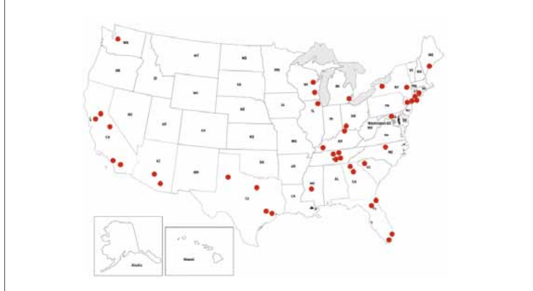
Map highlighting anti-mosque incidents across the country over the past five years.

As a result, Muslim American communities often spent years searching for developments sites before finally succeeding. In fact, it was not unusual for them to settle for parcels that were undesirable but more likely to be approved, or to make considerable compromises on their original plans. 4