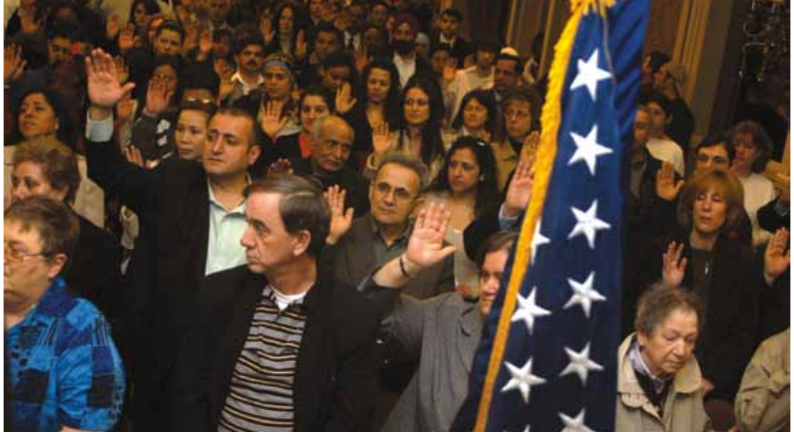
Attaining citizenship at an Islamic community center.

It should be noted that only a small percentage of RLUIPA challenges to municipal decisions have been filed by Muslim American communities. As was discussed in the case study section of this report, even with RLUIPA's broad protections, Muslim communities frequently concede to restrictions ordered by local officials, even when those restrictions infringe on their right to freely practice their faith. The increasingly hostile anti-Muslim sentiment since September 11th seems to pressure Muslim communities to compromise with neighbors and public officials to a degree beyond what likely would be considered acceptable by mainstream faith communities. The result, I contend, is an unequal application of land use laws among faith groups. In effect, RLUIPA, and indeed the First Amendment, only protect those religious groups that feel they hold sufficient political capital to demand the enforcement of laws.