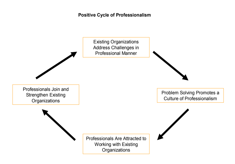
Figure 3b: Positive Cycle of Professionalism

Creating a culture of professionalism in the sector can break the negative cycle of "compelled" entrepreneurship. As illustrated in the figure below, increased professionalism can result in a positive cycle by which human capital is attracted to the sector.