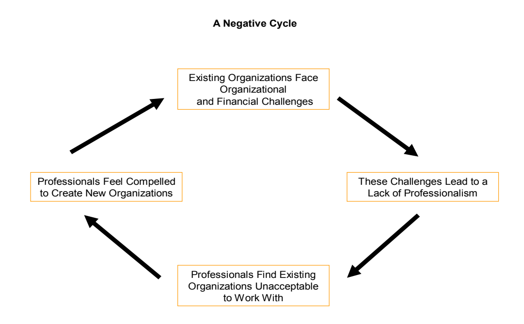
Figure 3a: Compelled to Entrepreneurship

Competition in the social sector – just as in the commercial sector – can certainly be healthy and can lead to a strengthening of the overall industry. In our view, however, the current state of the Islamic nonprofit sector is one which calls for greater collaboration (and, in some cases, consolidation) rather than increased competition.